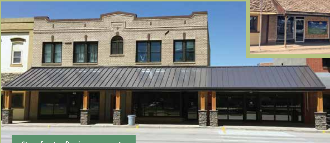
Store fronts after improvements.

The program is effectively stimulating investment by downtown businesses and commercial property owners to improve the appearance of their buildings. A total of 44 commercial projects have been completed since the program began in 2006 with $609,000 awarded as matching funds for slightly more than $2 million in improvement projects.