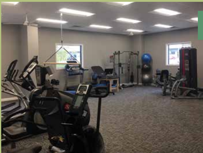
Mobility Plus, a physical and occupational therapy provider.

Building renovations helped establish new businesses, expand existing businesses, and increase job opportunities, creating an overall improvement in quality of life for the citizens of Valley City and Barnes County.