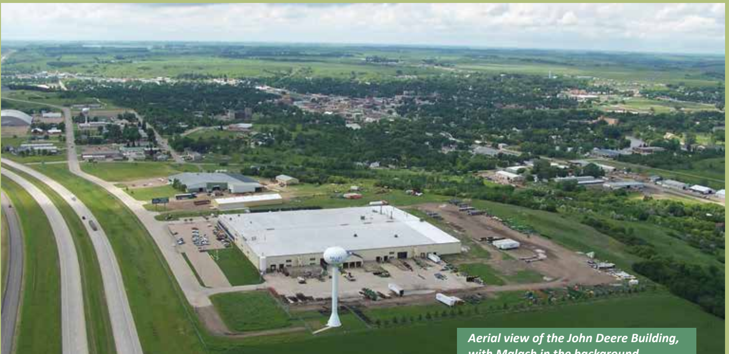
Aerial view of the John Deere Building, with Malach in the background.

The companies have contributed to various community projects and organizations directly impacting education, recreation, health and quality of life. Examples include the Career and Technology Center, Wellness for All Program, Sheyenne Valley Community Foundation, STEM education, Backpack Program and more.