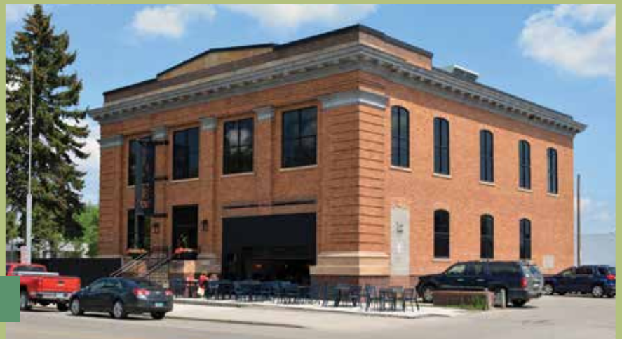
City Brew Hall