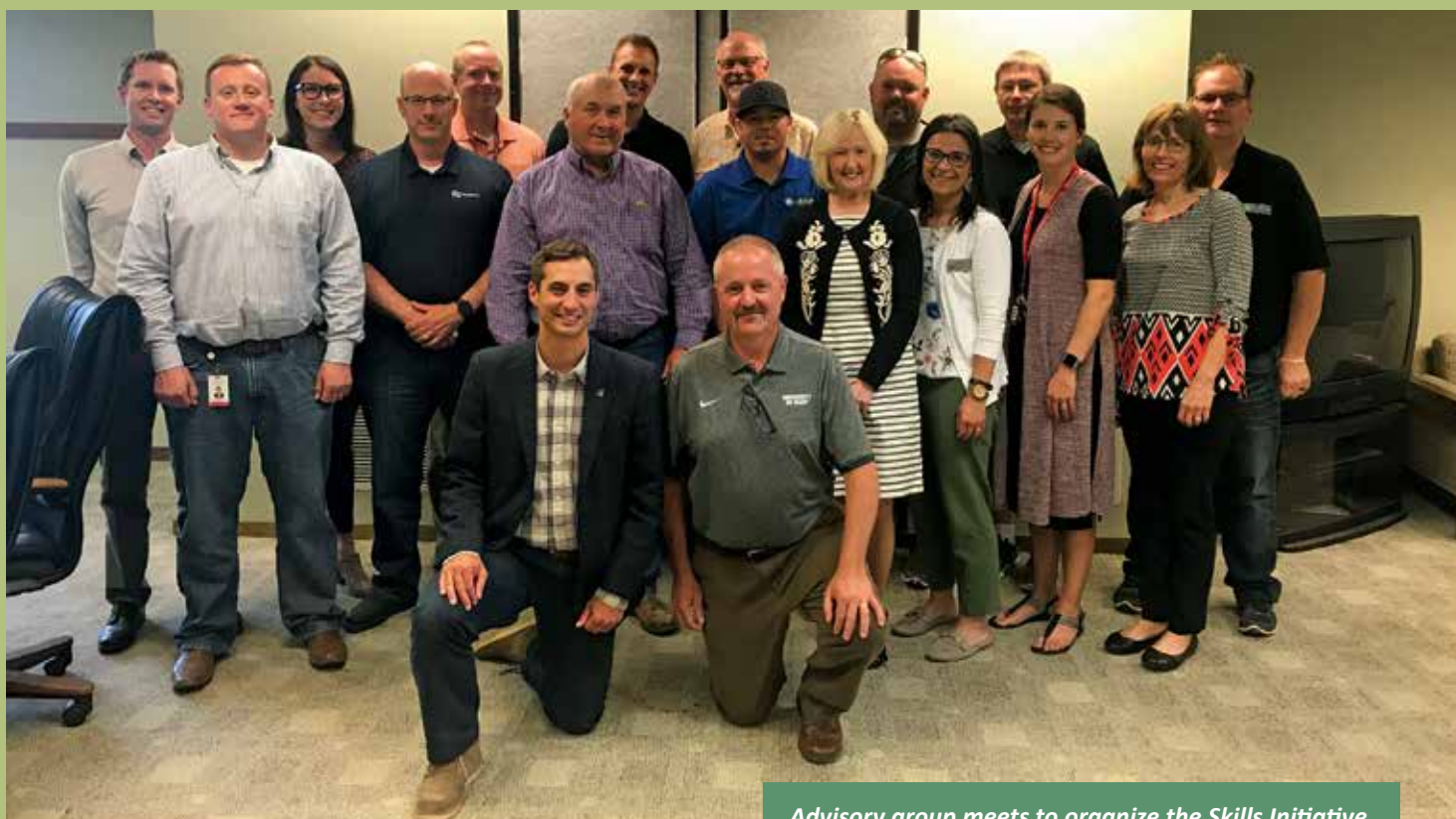
Advisory group meets to organize the Skills Initiative.

The program launched in 2017 and provides an ongoing dialogue about the needs of the community. The model is flexible and can evolve to ever-changing workforce needs.