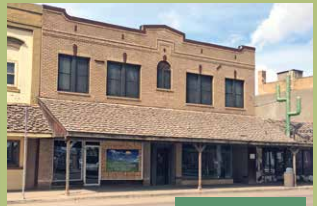
Store fronts before improvements.