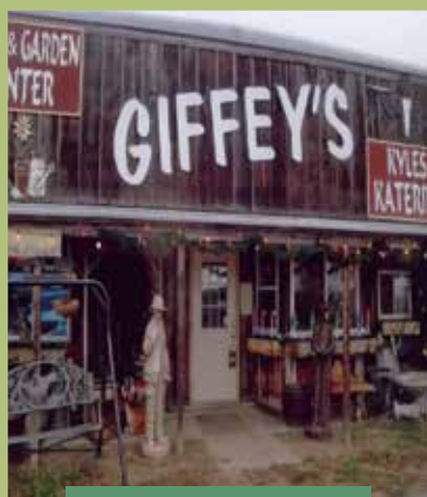
Kyles Katering before

The overall impact to the community is an increased quality of life for residents, the attraction of tourists to the town and the retention of local businesses.