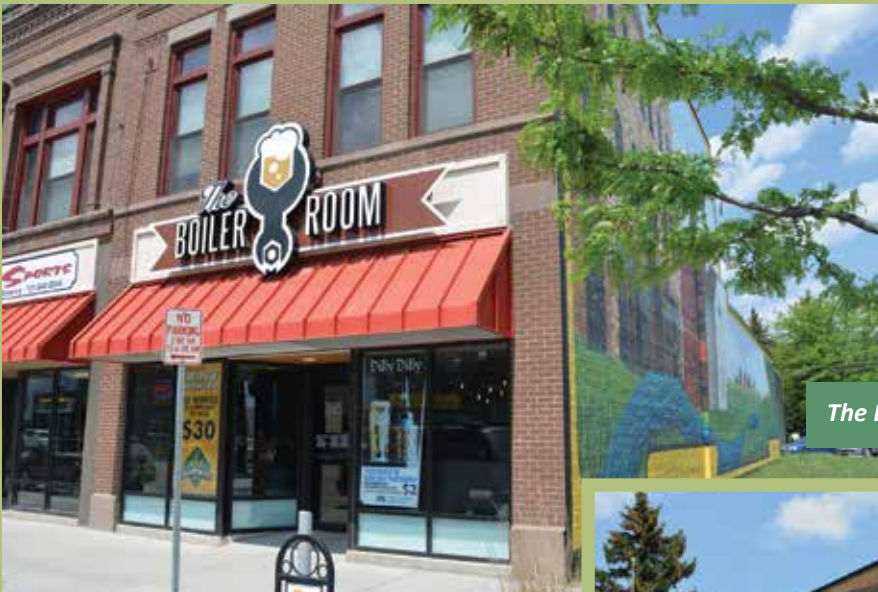
The Boiler Room

The two new restaurants generate restaurant tax funds to be used for community enhancement. Two vacant buildings are now restored, creating unique event spaces and bringing more visitors downtown during the evening hours.